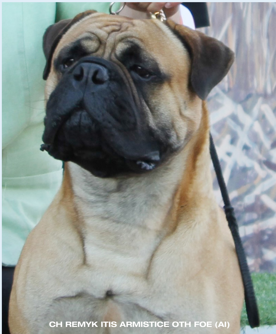
CH REMYK ITIS ARMISTICE OTH FOE (AI)