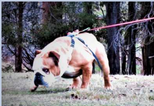
DUAL CH (T) SNOBUL AND THE BEAT GOES ON (AI) RA TSD