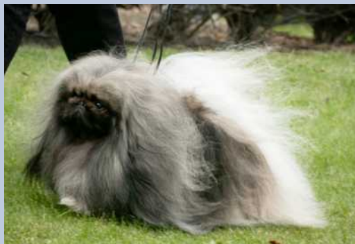
SUP CH MIYOKO ERIK WITH A DRAGON TATTOO