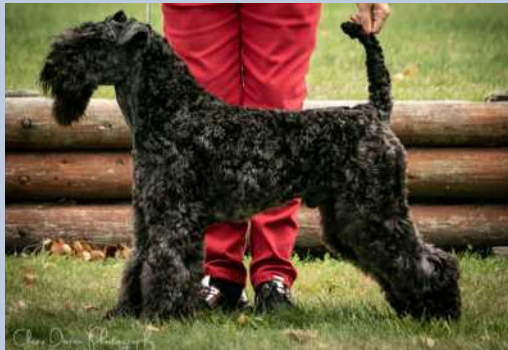
CH TASSHOT CRAZY LOVE