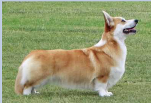
SUP CH VANHARON MISS FISHER